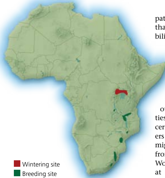
■ Wintering site ■ Breeding site

patterns. A few years ago, we realised that these techniques were in all probability the only way to reveal the secrets of the Blue Swallow's migration. We therefore set about obtaining feather samples from South African, Swazi and Zimbabwean swallows, with the intention of establishing whether these populations differ from each other in terms of the isotopic properties of their feathers. In order to make certain that we did not analyse feathers that had grown elsewhere prior to migration, we collected specimens only from nestlings and first-year juveniles. Working with Dr Stephan Woodborne at the CSIR in Pretoria, we measured the relative abundance of two stable isotopes of hydrogen in the feathers. Our initial results were encouraging: the hydrogen stable isotope ratios of feathers from South African and Swazi swallows were distinct from those of Zimbabwean birds, with no overlap in values. This approach can therefore be