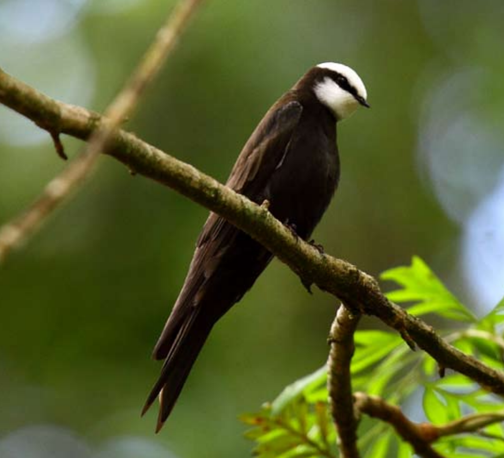
ADAM RILEY (2)

Above White-headed Saw-wings Psalidoprocne albiceps are common at Nyika, and may be seen foraging in the same habitats as Blue Swallows.