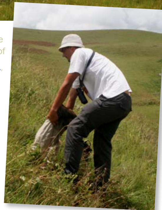
Above Blue Swallows typically breed in disused aardvark burrows, and reaching their nests can require gravity-defying teamwork.

The trip also yielded some interesting observations. On one occasion, a group of approximately 30 Blue Swallows, together with Banded Martins and White-headed Saw-wings, was seen foraging over a marshy area, probably attracted by large numbers of insects. Another observation involved a Blue Swallow very nearly ending up as a meal for a stooping Eurasian Hobby – the swallow lived to see another day only because of some frantic evasive manoeuvres.