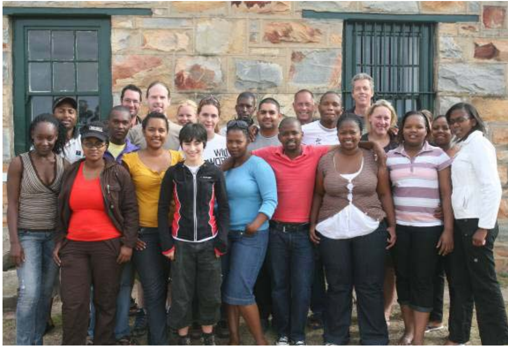
Figure 2. Participants in the fourth Biodiversity Conservation Academy held at De Hoop Nature Reserve during January 2010.