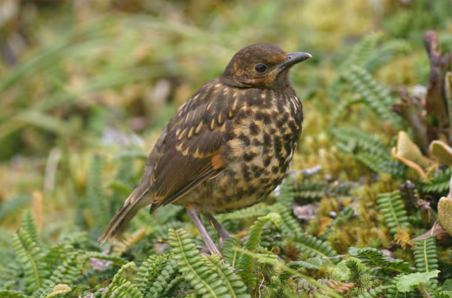
Opposite, above A newly-fledged Tristan Thrush, or Starchy, showing the richly coloured primary coverts and apricot-streaked scapulars typical of juvenile plumage.