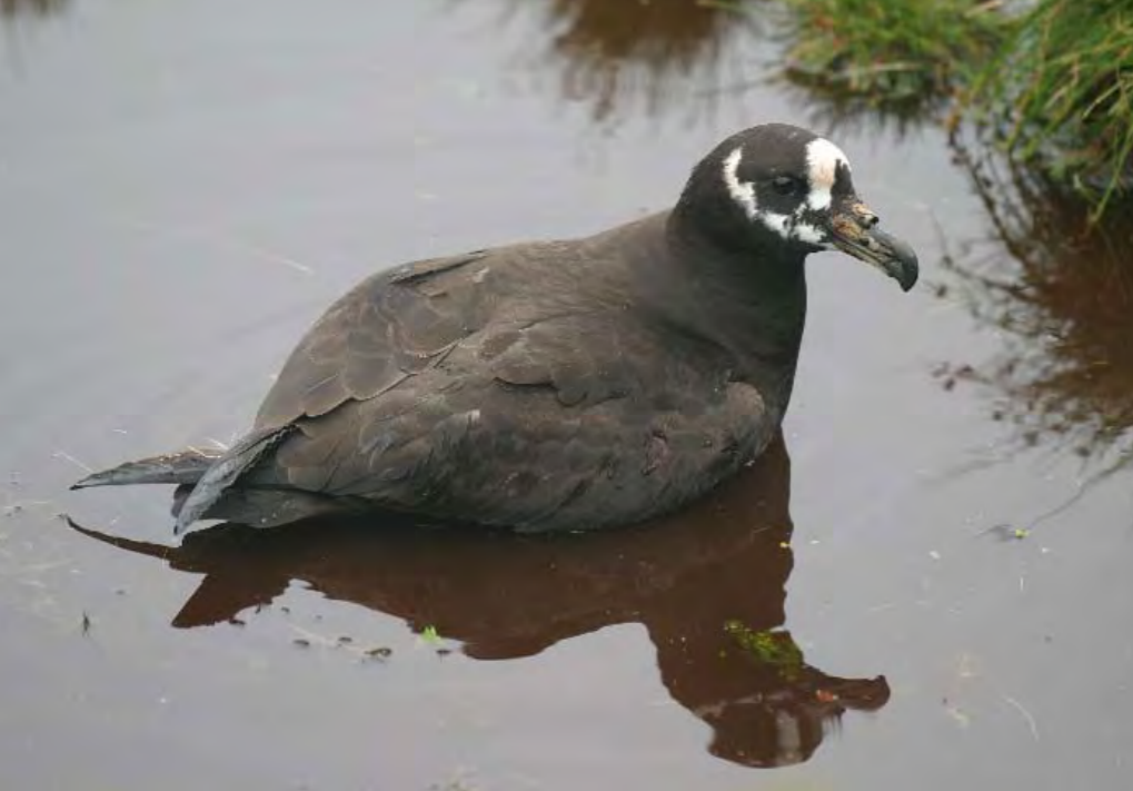
Above A Spectacled Petrel in the large moat that is typical of many breeding burrows.