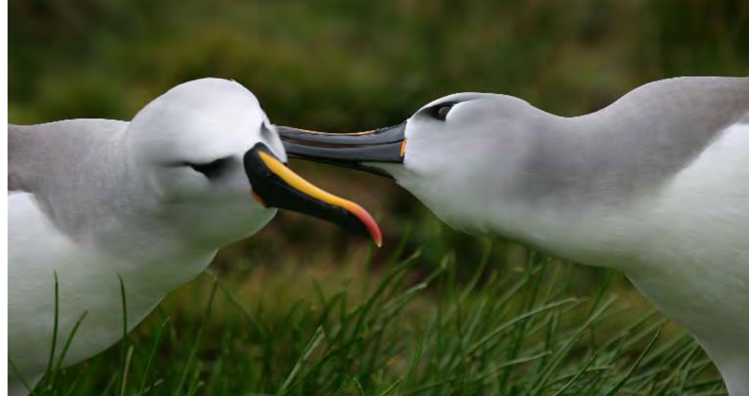
By November, most Yellow-nosed Albatrosses are reaching the end of incubation, but some non-breeders still hang around, courting and establishing pair-bonds by allopreening.

Although Inaccessible Island is currently free of any introduced mammals, it has suffered from human impacts in the past. At various stages goats, sheep, cows, pigs and even a couple of dogs have been left to run wild on the island. Of these, pigs had probably the greatest impact on breeding seabirds. Wild pigs are formidable predators and have been responsible for wiping out burrow-nesting seabirds on several other islands. Fortunately, at Inaccessible the feral population appears to have died out early in the 20th century, but by this stage they had reduced Ringeyes to a perilously small population. The Tristan islanders only recorded the birds breeding on the island in the 1920s, and when the Norwegian Scientific Expedition visited the island in 1937, Yngvar Hagen estimated that the population stood at less than 50 pairs.