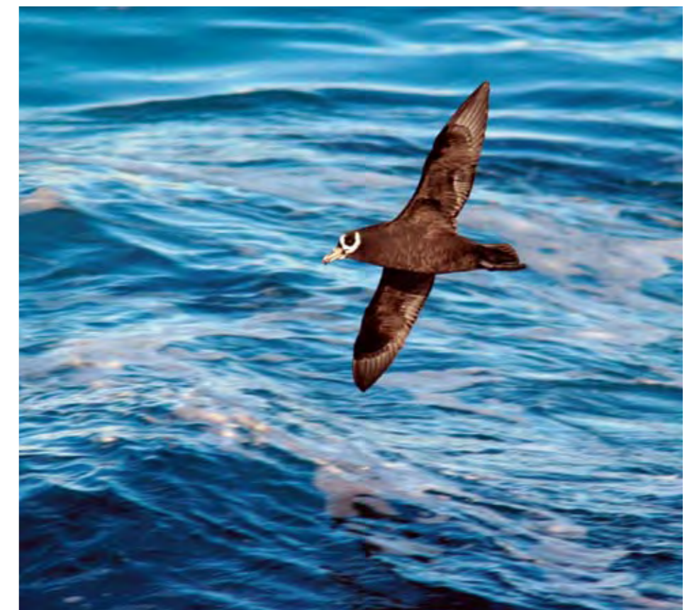
Below A Spectacled Petrel sweeps low over the sea behind the fishing vessel. Like the closely-related White-chinned Petrel, Ringeyes follow vessels persistently, but tend to remain in warmer oceanic waters than their more southerly cousins.