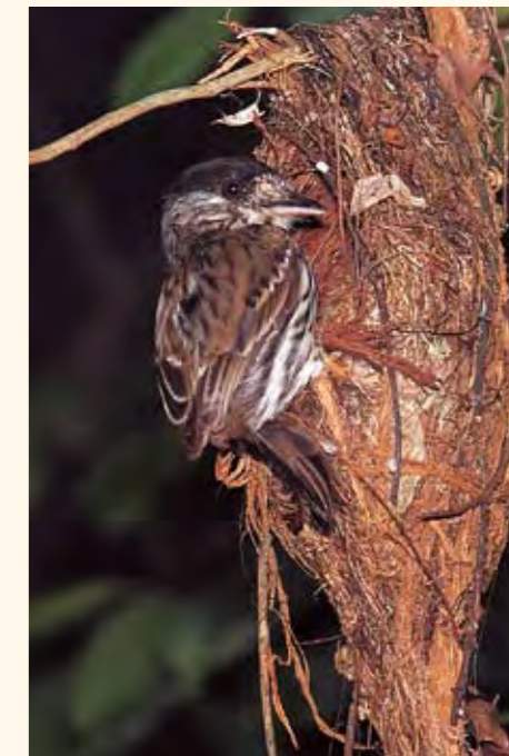
AFRICAN BROADBILL PETER STEYN

Fringing Chimanimani village, the small Eland Sanctuary reserve offers a peep at what the highlands must have looked like